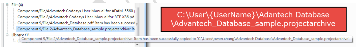
Figure 2. the location of Advantech_Database_sample.projectarchive